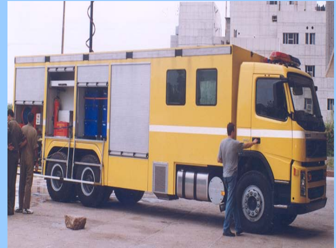
Stand by Fire Units at each Venue