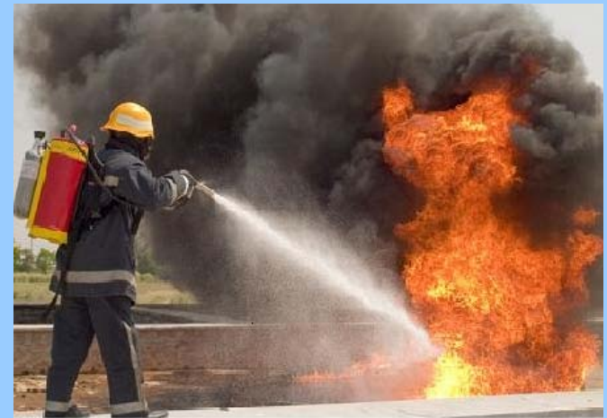
Firemen with Back Pack & Comm. System in the Stadia